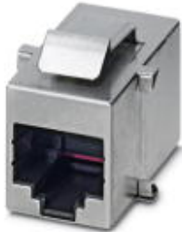
RJ45 socket insert, modular (Keystone), CAT5e, 8-pos., shielded, socket on socket

Please be informed that the data shown in this PDF Document is generated from our Online Catalog. Please find the complete data in the user's documentation. Our General Terms of Use for Downloads are valid ( http://download.phoenixcontact.com )